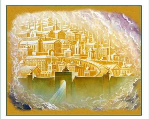
and there is no place for a millennium."

"According to the scripture, there is no need for a millennium, no time for a millennium,