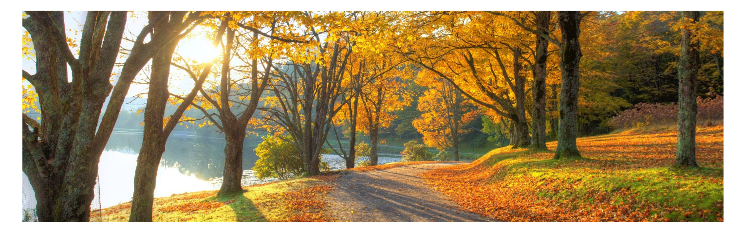
SUPPLEMENT TO THE GOSPEL TRUTH, ISSUE 14