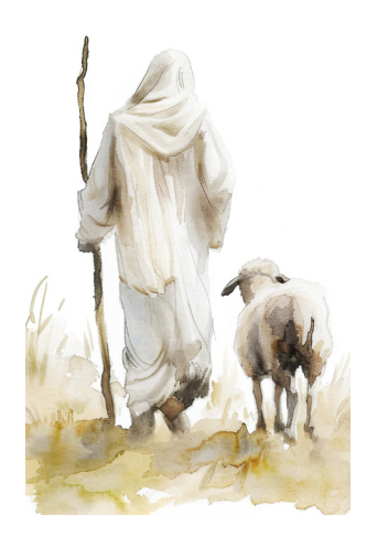
"Obedience is not about fear or bondage—it is the natural fruit of true love for God."

Choosing God's way for a life of blessing and eternal reward.