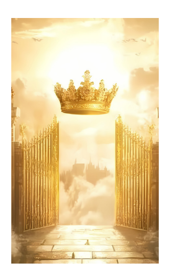
"If we obey Christ's teaching, we will gain eternal life and enjoy the blessings of Heaven."